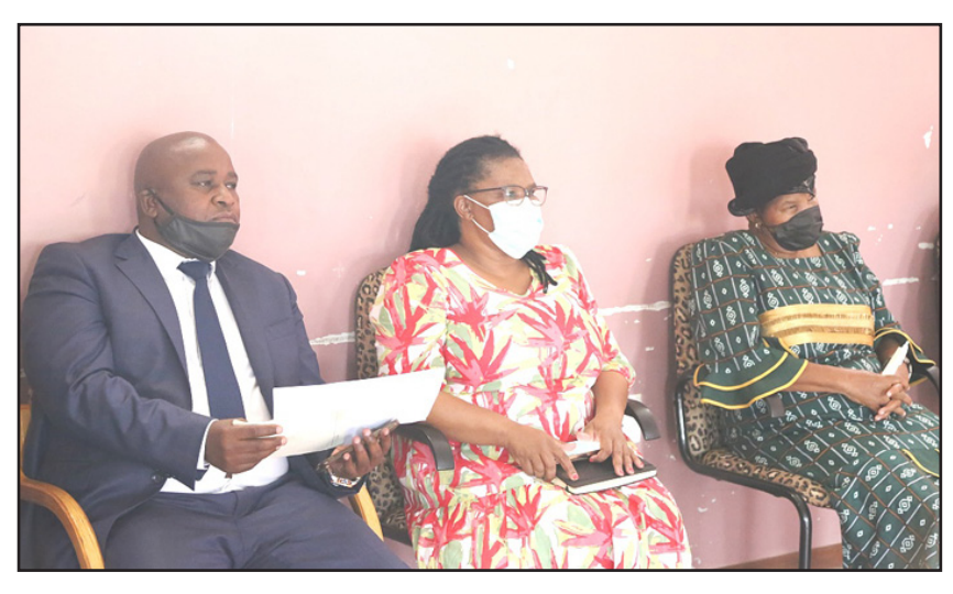
From left, Deputy Minister Mcebisi Skwatsha, MEC Nonkqubela Pieters and Deputy Minister Zoleka Capa during the oversight visit in Eastern Cape.