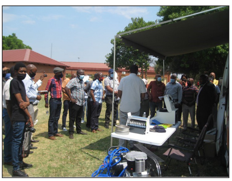
Participants at the Soil Survey and Fertility Management Workshop attend the mobile soil testing laboratory demonstration.

The visit to Taung Agricultural College was a great opportunity for the mobile soil testing laboratory team to create further awareness about the mobile lab and the services offered by the ARC to various stakeholders in the agricultural sector.