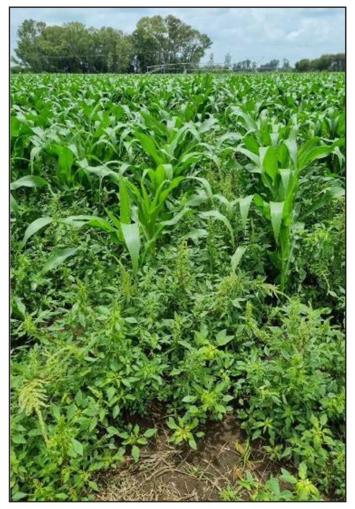
Palmer amaranth in maize.

under the Conservation of Agriculture Resources Act, 1983 (Act No. 43 of 1983), involving officials in the Palmer amaranth action committee, and following up with written communications. A draft regulation to this effect was published on 24 December 2020 but the department has not formally promulgated the regulation to put control measures into effect yet.