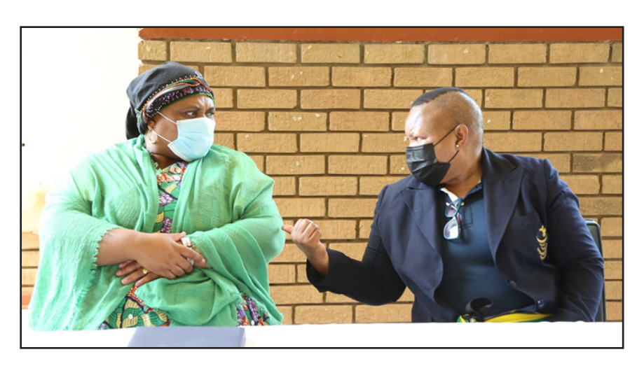
Minister Didiza and MEC Boshielo paid a courtesy visit to the Modjadji Royal Authority.