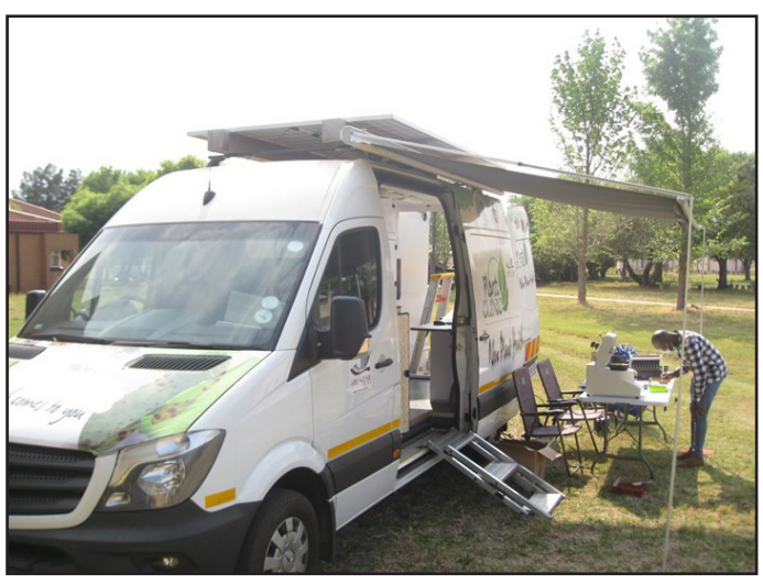
The ARC mobile soil testing laboratory at Taung Agricultural College.